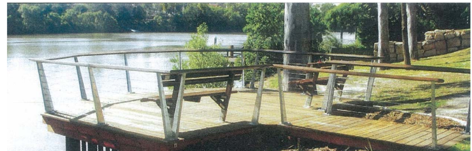
INDICATIVE TIMBER DECKING